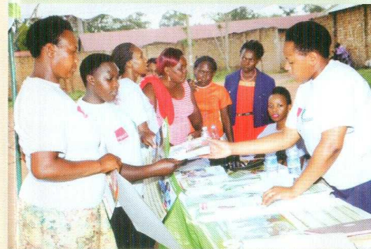
Pulojekiti ya WEJ ewa abakyala ebiwandiika ebibasomesa ebikwata ku butale n'obusuubuzi