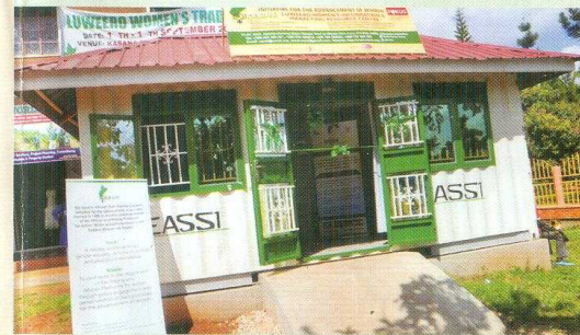
Ekifo kya EASSI abakyala webamanyira ebifa kubusuubuzi n'ibutale