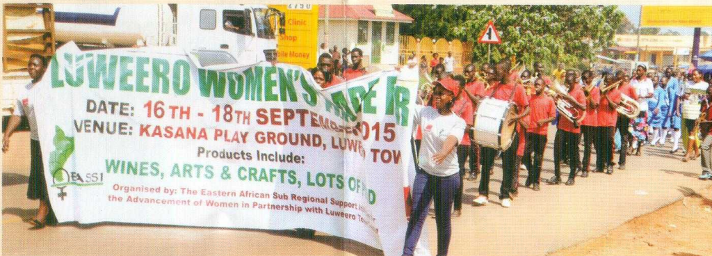
EASSI etegeka emyoleso gy'abakyala era nebawagira okugyetabamu