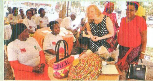
Abakyala balondoolwa buli kiseera okulaba nga byebakola bitukana n'omutindo