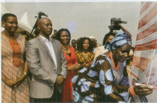
Ugandan Minister of Trade of Trade Industries and Cooperatives, Hon. Amelia Kyambadde signs off the charter for cross border traders at Mirama/Kagitumba OSBP