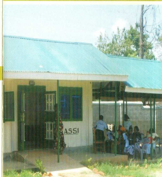
The EASSI Busia resource center- a hub of information for WCBTs

The Eastern African Sub-regional Support Initiative for the Advancement of Women