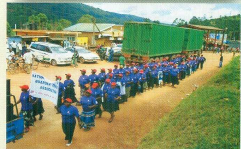
Katuna WCBTA creating awareness about Women Cross Border Traders Association