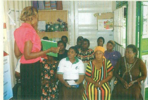
Women traders utilizing the services of the EASSI resourcecenter